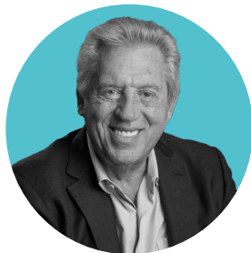
JOHN C. MAXWELL

Speaker, Executive Coach, WSJ Best-Selling Author